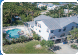
SEAGULL BAY 3/2 POOL HOME Direct Access, pool home with beautiful tropical landscaping. $499,000