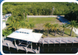
WATERFRONT LOT On Judge Bean with large boat house and deck, lift, new seawall, and water meter and electric in place. $399,000