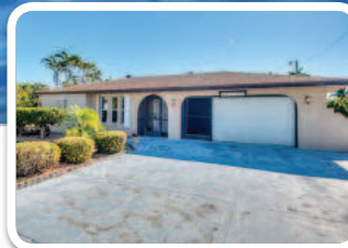
CHARMING 3/2 On double lot within walking distance of county boat ramp. Brand new A/C & water heater. Two additional, adjoining parcels available as well! Call Bob. $279,000