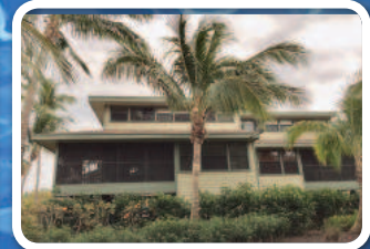
BOCILLA ISLAND CLUB Beautiful & Meticulously maintained 2/2.5 end condo unit. $289,000