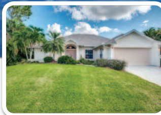
ALDEN PINES BEAUTY Gorgeous 3/2.5 with pond to fairway views in Alden Pines! Large screened Lanai and additional outdoor living area. Call Bob for your showing. $300,000