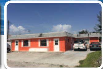
UNIQUE RESIDENTIAL/COMMERCIAL IN SJC Direct Access Waterfront building. Live and work in the same space. Office in the front and 2/2 residential along the intersecting canal. $549,000