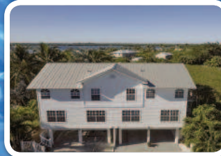
SEAGULL BAY BOKEELIA 3/2 Updated kitchen. Back Bay views, boat dock, lift. Private Community Beach. $449,000