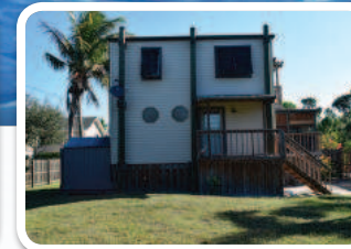
UNIQUE 2/2 Maine-style piling construction home in secluded section of Pineland. Large lot in quiet area near Tarpon Lodge, Pineland Marina and Alden Pines. Call Bob. $219,000