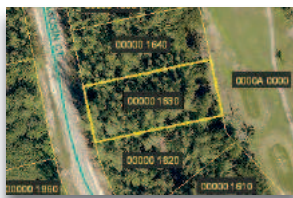
Pacosin Lot Lot is on second fairway of Alden Pines Golf Course, cleared and on paved road. Pineland Marina is a short walk away. Place your boat there and have quick access to Pine Island Sound, ICW and Gulf of Mexico. $39,900