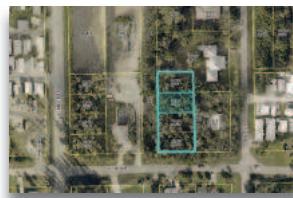
Fifth Ave, St. James City Opportunity to build 1-4 homes on this property, each lot 50' x 90'. A Paper street runs up the left side of property. Possible owner financing. $64,900 for all 4 lots.