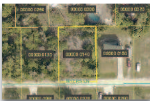
3606 Myers Lane, St. James City Cleared 90' x 133' vacant residential lot. Possible owner financing. $19,000