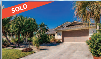
SOLD $435,000 Remodeled 3 Bed/2 Bath Canal-front home. Lots of space to entertain.